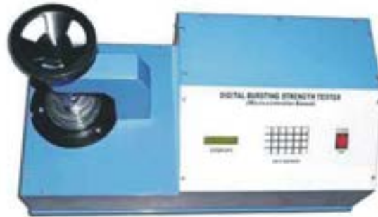
Bursting Strength Tester Micro Processor Based