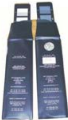
Gray Scale SDC, AATCC, and James H Heal