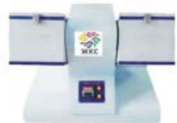
ICI Box Pilling Tester