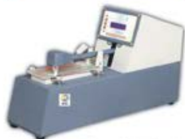
Digital Crock Meter ( Motorised )