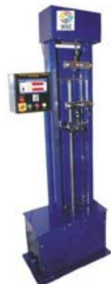
Tensile Strength Tester