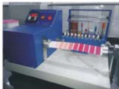
Shade Card Winding Machine