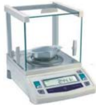
Chemical Balance 200 GRAMS 0.001