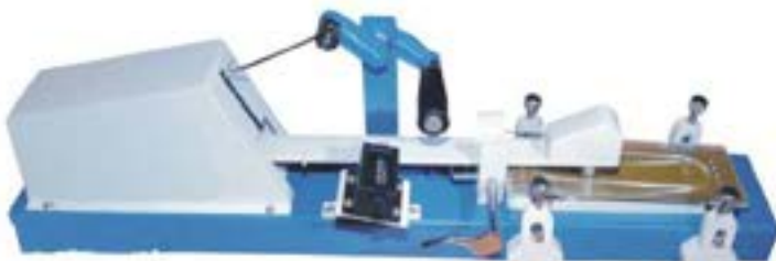
Crock Meter ( Manual )