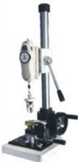
Button Snap Pull Tester