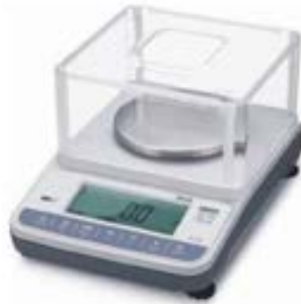
Electronic GSM Scale 600 GRAMS 0.01