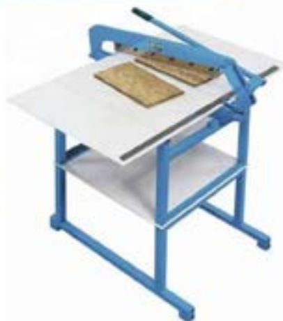
ZIG-ZAG SWATCH CUTTER