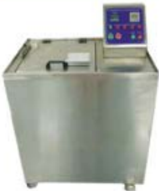
Washing Fastness Tester