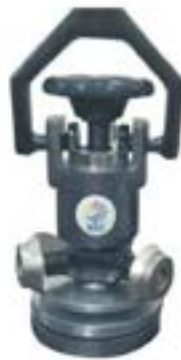
WKC Hydraulic GSM Round Cutter