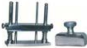
Perspirometer Fully SS Model Standards: ISO 105, BS 1006, AATCC 15, 106, 107, 165