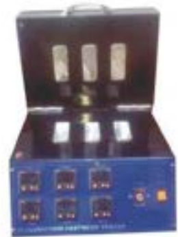
Sublimation Fastness Tester