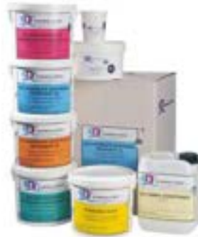
Washing Detergent ECE(A) & ECE(B)