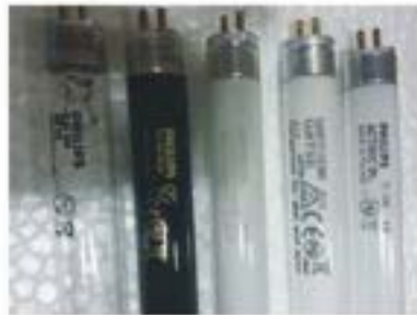
Color Matching Tubes