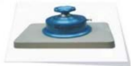
GSM Round Cutter