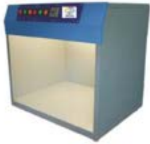
Colour Matching Cabinet D65, TL 84, CWF, UV, INCA, UL30