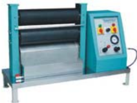
Laboratory Padding Machine