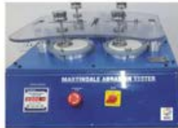
MARTINDALE ABRASION TESTER