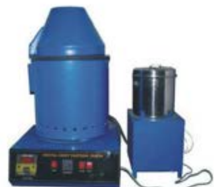
MBTL LIGHT FASTNESS TESTER