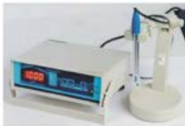
PH METER TABLE TOP