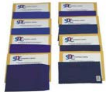
ISO BLUE WOOL