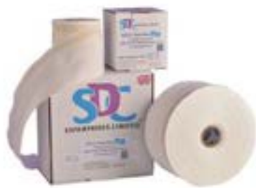
Multi Fibers SDCDW & Style 42